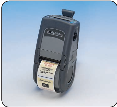
QL 220 Plus™

Take 2-inch label, ticket, and receipt printing where stationary and larger mobile printers dare not go—whether it's down store aisles, on hospital rounds, or onto retail pharmacy counters. Strap or clip on the sleek, 1.04-pound QL 220 Plus network-addressable label/receipt mobile printer and move with ease!