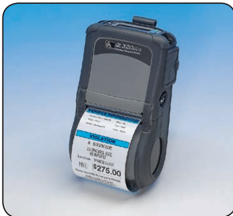
QL 320 Plus™

Zebra's popular QL 320 Plus mobile printer, for print widths up to 3 inches, was the first to offer the flexibility of 802.11b/g radio modules to meet evolving needs and wireless standards. Count on its durable design to endure tough manufacturing or shipping/receiving environments.