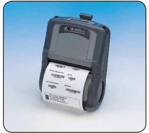
QL 420 Plus™

Bring the flexibility of wireless printing to your 4-inch label or receipt applications with Zebra's QL 420 Plus mobile printer. Built to survive the rigors of warehousing, distribution, and route accounting, the QL 420 Plus offers a mobile mount option to allow printing in a forklift or vehicle.