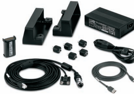
RD5000 Mobile RFID Reader accessories

maximizes your return on investment. An exceptional investment, the device can be easily moved and temporarily mounted from one application to the next — from skate wheel conveyor receiving to pallet jack storage to mobile cart inventory — providing the flexibility to meet multiple and temporary RFID needs throughout the enterprise. Your expanded view of operations enables tighter management control. Present staff can accomplish more throughout the workday, better controlling labor costs. Improved inventory visibility enables a reduction in stocking inventory, as well as in the associated costs and space requirements. And the rugged design ensures maximum uptime — and a low total cost of ownership.